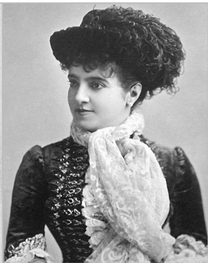
The great soprano Adelina Patti (1843-1919) in 1882