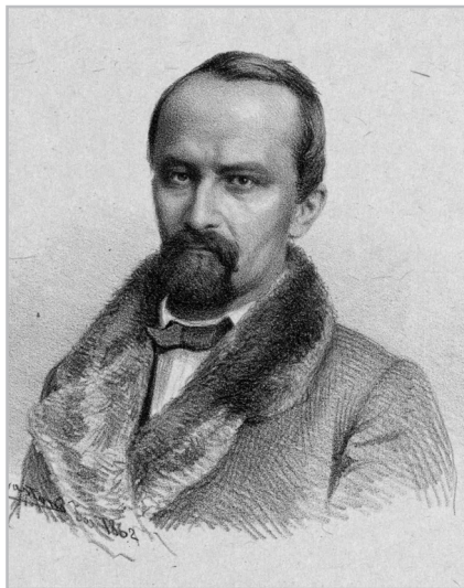
Franz Doppler in 1862