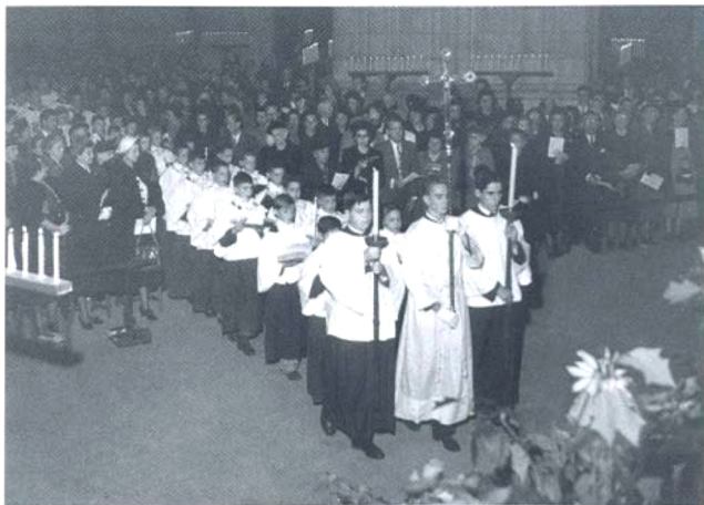
Christmas Eve procession, 1949.