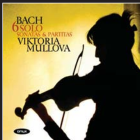
ONYX 4040 Bach: Sonatas and Partitas