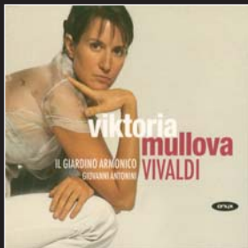
ONYX 4001 Vivaldi: Violin Concertos Il Giardino Armonico · Giovanni Antonini

Also available from Viktoria Mullova on ONYX