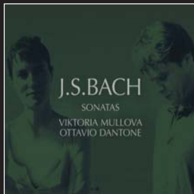
ONYX 4020 Bach: Violin and continuo sonatas Ottavio Dantone