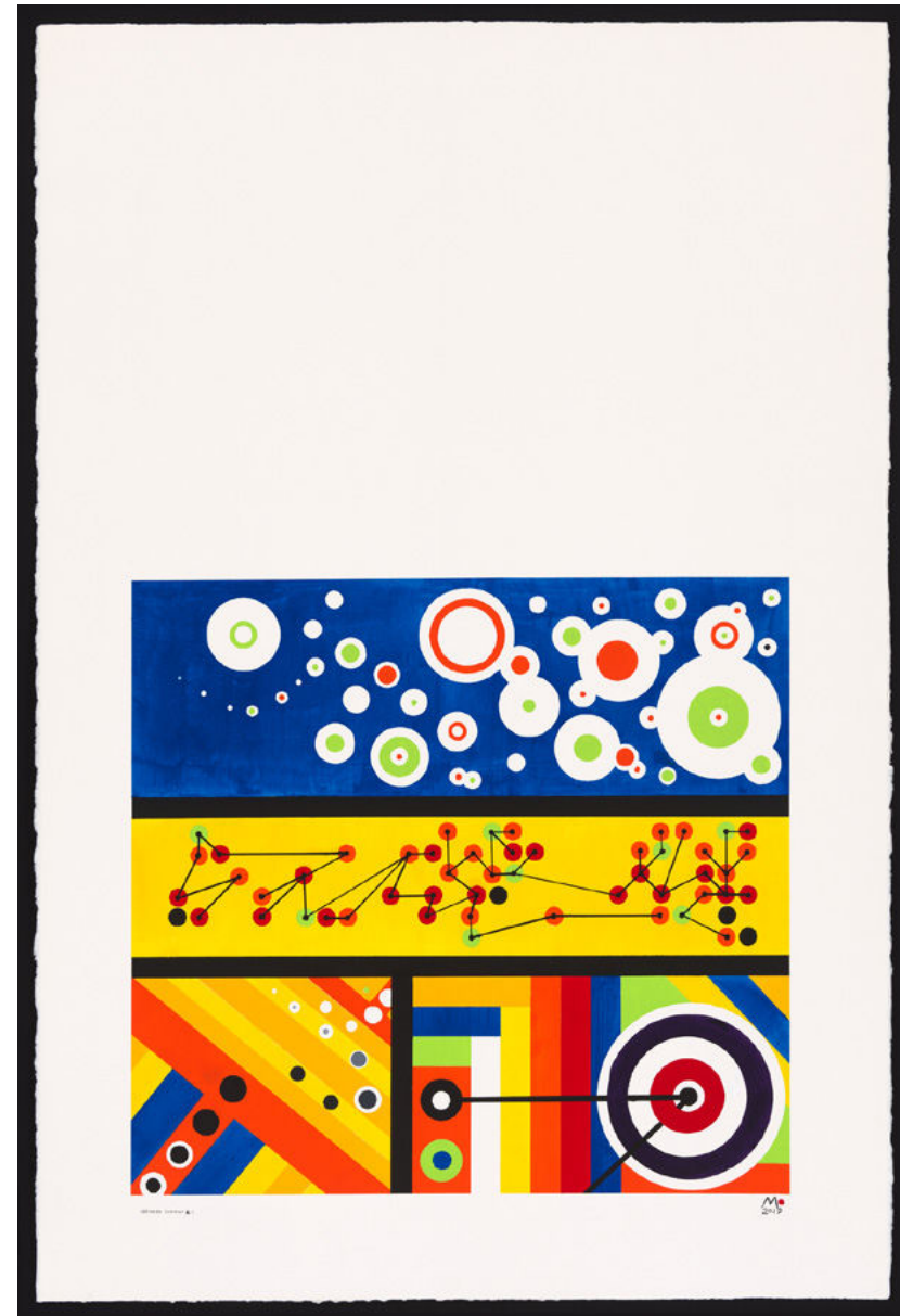
Symphony No. 1 by Mo Willems