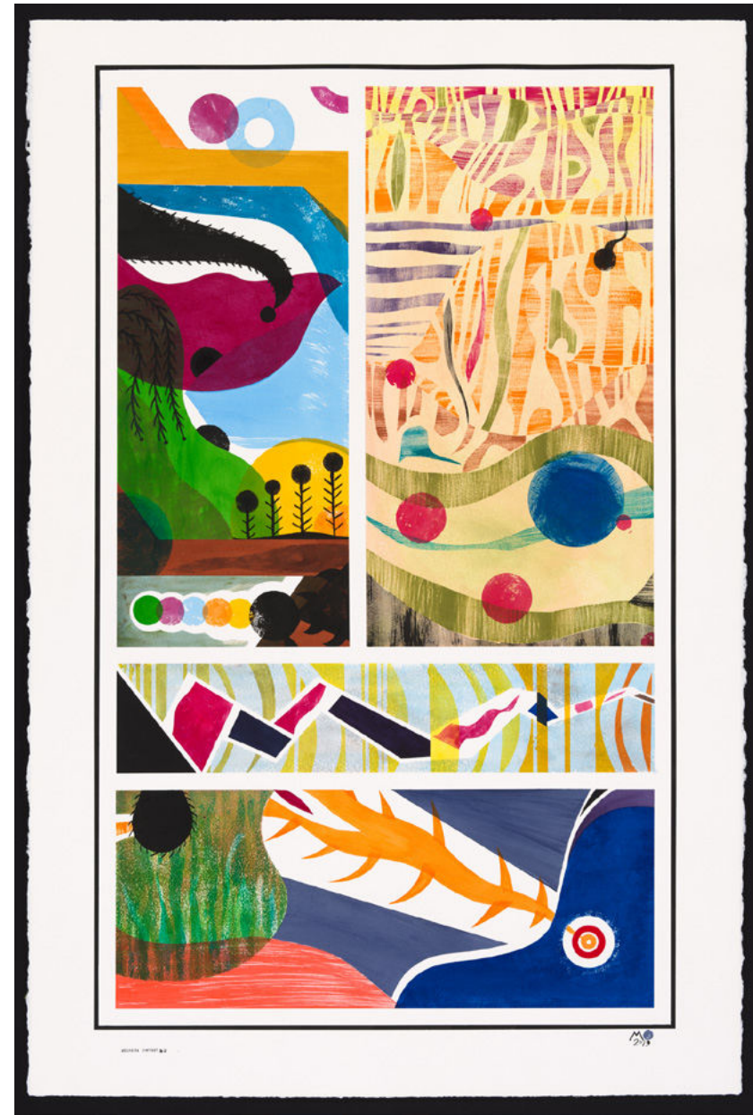
Symphony No. 3, "Eroica" by Mo Willems