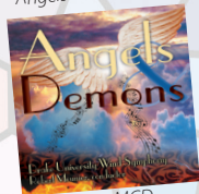
Angels and Demons