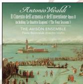
The Avison Ensemble Vivaldi: Concerti Op. 8