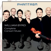
Phantasm Byrd: Complete Consort Music

For even more great music visit linnrecords.com