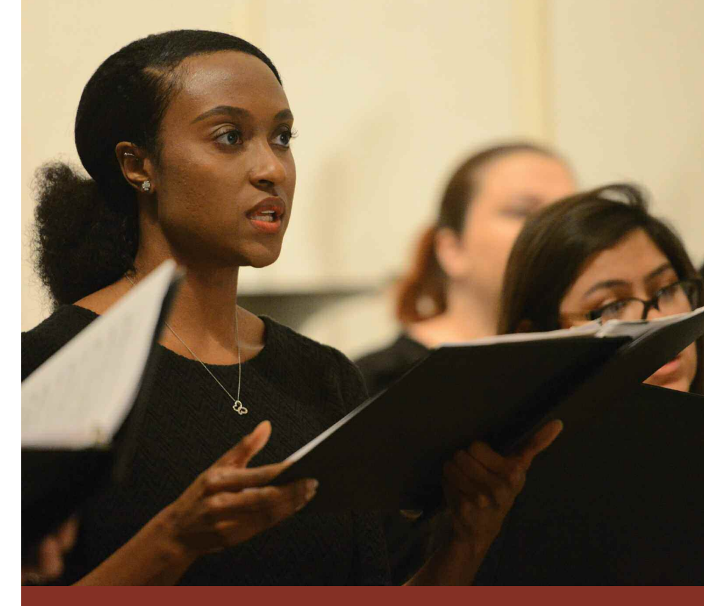
14. Sweet Was the Song Text: W. Ballet

Today Christ is born: Today the Savior appears: Today the angels sing on earth, and the Archangels rejoice. Today the just exult, saying: Glory to God in the highest. Alleluia.