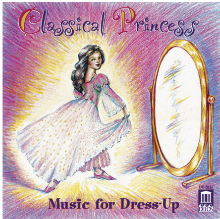
CLASSICAL PRINCESS - Music for Dress-Up • DE 3215