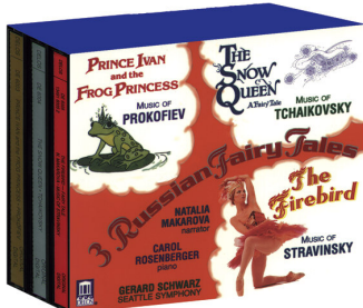
3 RUSSIAN FAIRYTALES DE 6010