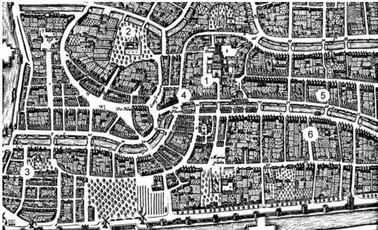
Jacob van Eyck in Utrecht: