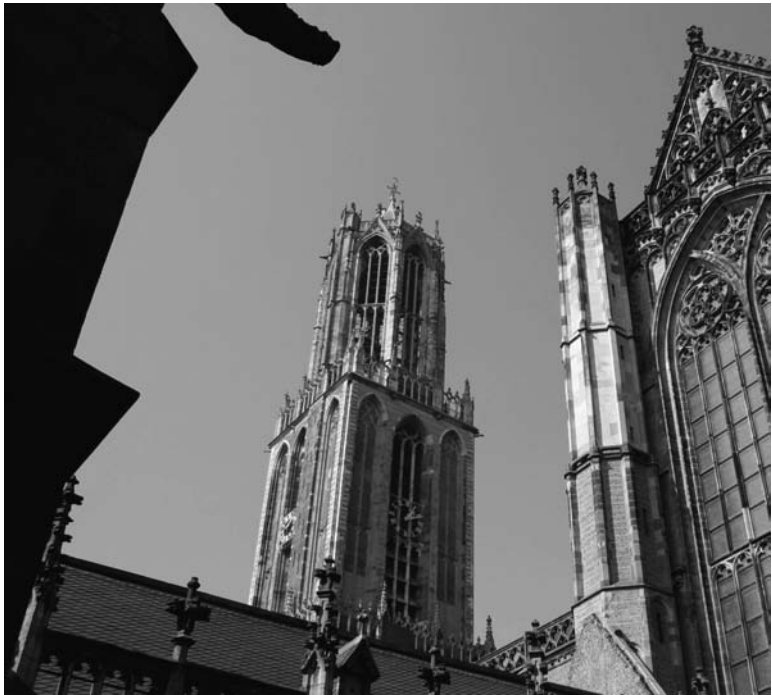
The tower of the Dom Church of Utrecht, 112 meters high and the tallest in the Netherlands, was Jacob van Eyck's home ground for many years.